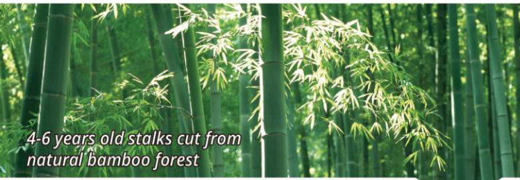
4-6 years old stalks cut from natural bamboo forest