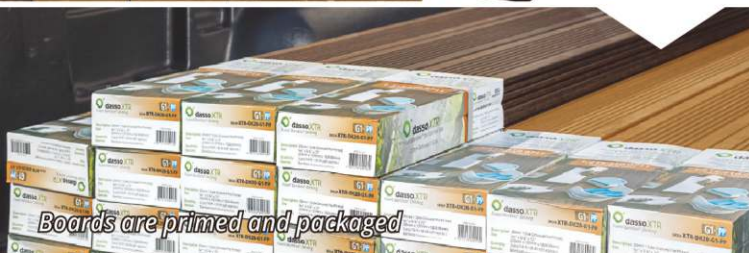
Boards are primed and packaged