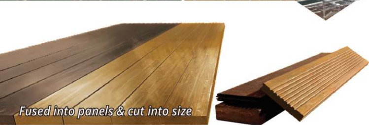
Fused into panels & cut into size