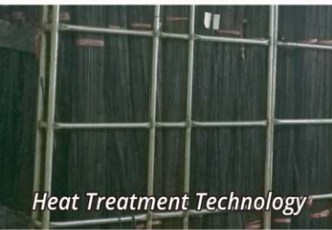
Heat Treatment Technology