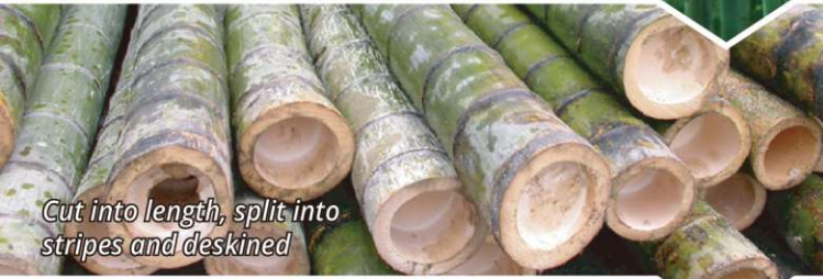
Cut into length, split into stripes and deskins